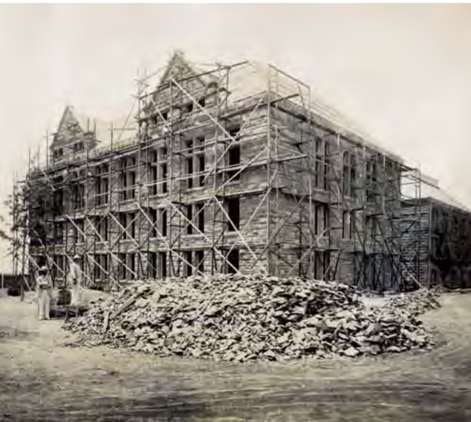
Left: Hawaiian Hall under construction, ca. 1899.