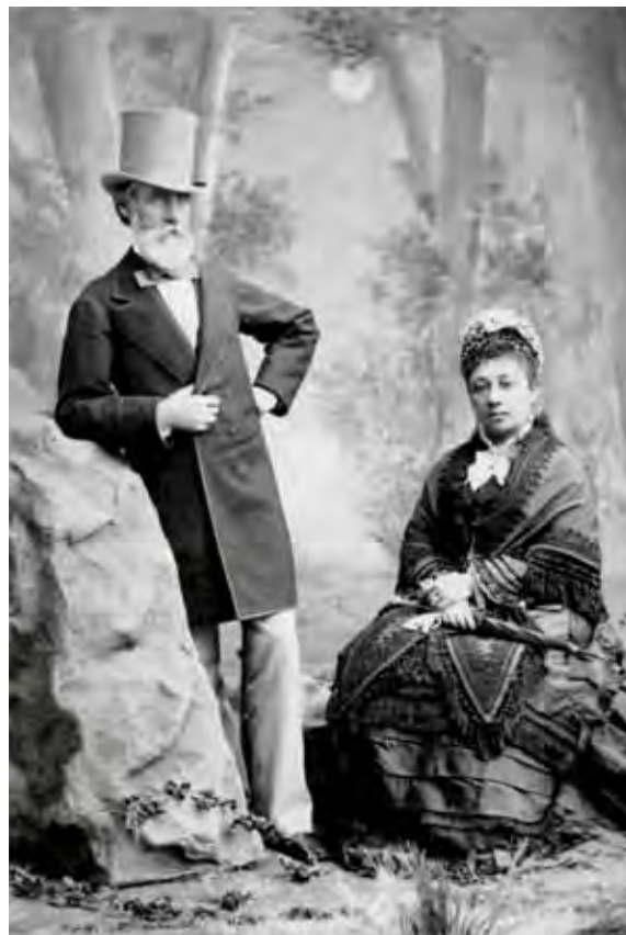
Right: Charles Reed and Bernice Pauahi Bishop, 1875.

willed her estates to her beloved cousin, Bernice Pauahi Bishop. Finally, when Bernice Pauahi died at the age of 52 without children, her lands were dedicated in trust for the benefit of the education of Hawaiian children. None of us today can imagine the grief and the loss our chiefs endured during their lifetimes, but that is, in many respects, the task of Bishop Museum—to keep the names, the struggles, the ideals, and the stories of our ali'i alive.